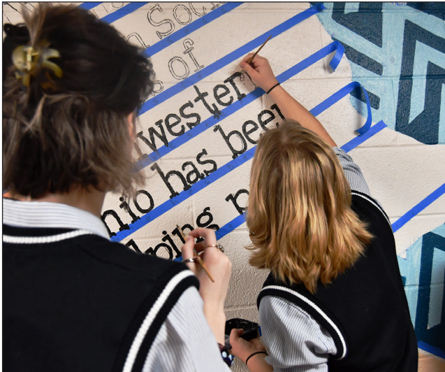
Students from St. Ursula Academy worked on a mural in the LSS Emergency Choice Food Pantry in March.