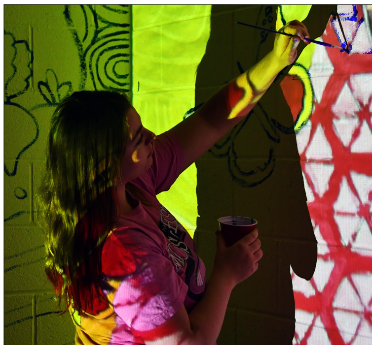
A St. Ursula senior student paints an outline of the mural in March.

It was finalized late in the month, and a official unveiling was held on April 5.