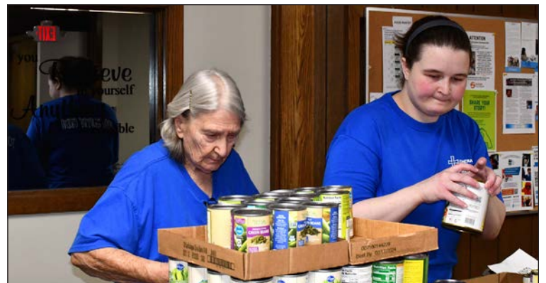
LSS volunteers sort through donations after the Stock the Shelves event in 2023.